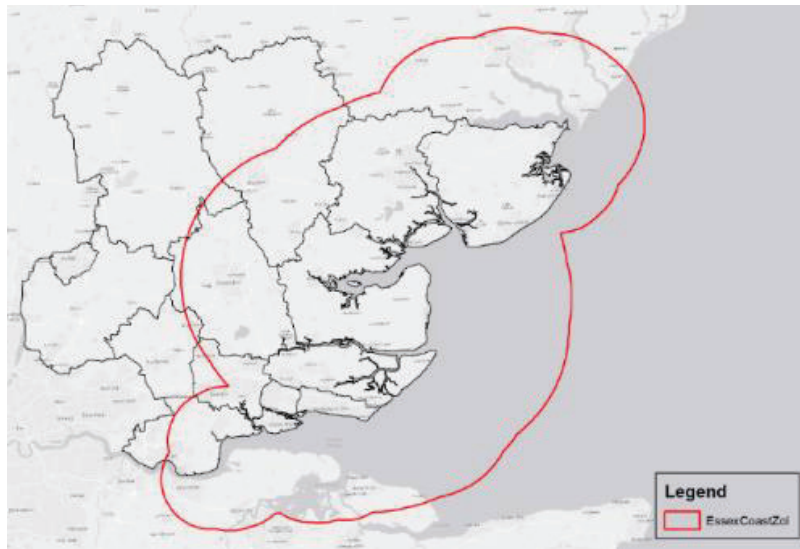
Figure 3.1: Broad Illustration of the Zone of Influence for the Essex Coast RAMS

The Zol has been calculated from these distances and can be accessed via Magic Maps, where you will find the definitive boundaries. A broad illustration of extent of the RAMS Zol is shown in figure 3.1, below.